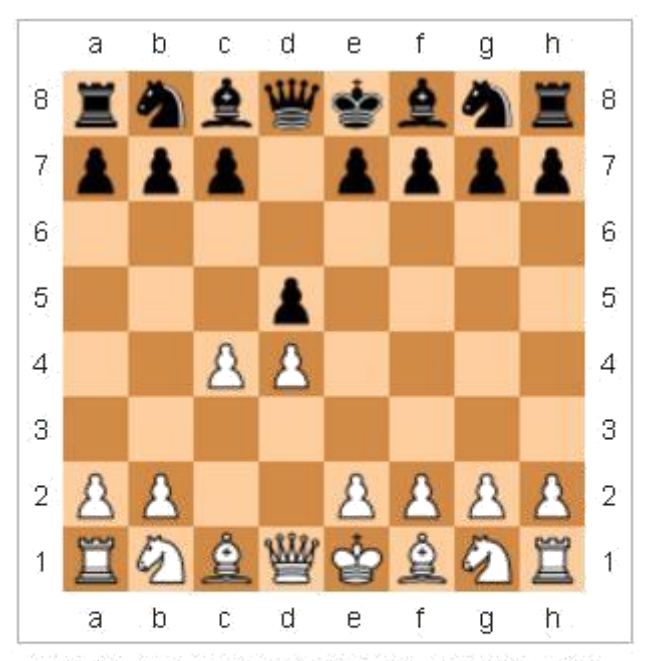
Queen's Gambit: 1.d4 d5 2.c4. If Black takes the pawn (...dxc4), White can move e2–e4 and take control of the center, while threatening to capture the black pawn with the bishop (Bxc4).