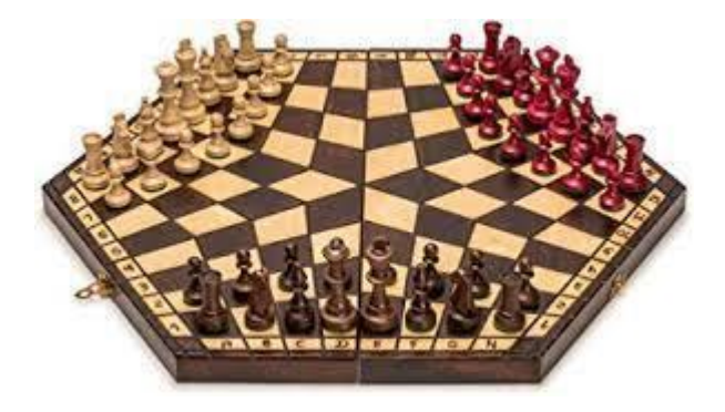
Fig.5: Three-player chess