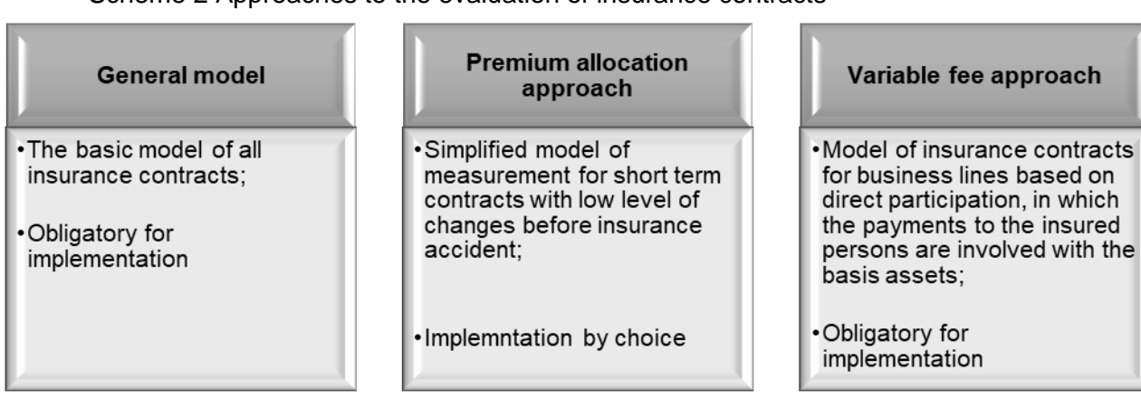
Scheme 2 Approaches to the evaluation of insurance contracts

Within the accounting model, the standard provides for the possibility of applying three approaches to the valuation of insurance contracts. (Scheme 2)