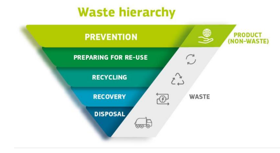
Fig.1 Waste management hierarchy